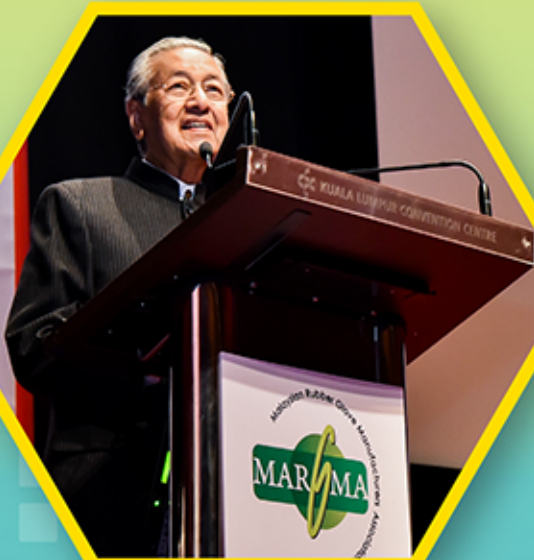
Tun Dr. Mahathir bin Mohamad Prime Minister of Malaysia