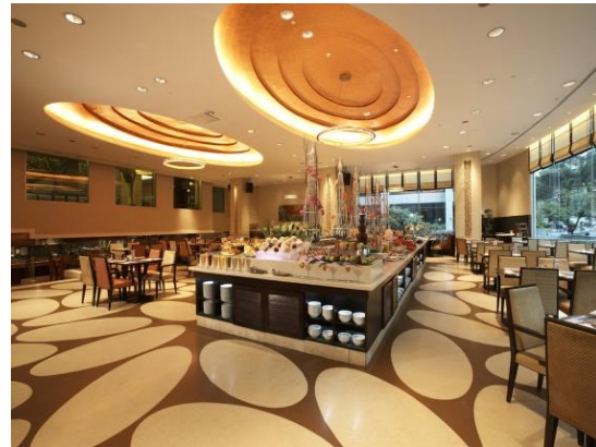
TONKA BEAN CAFÉ

A modern and spacious room at 36sqm for your comfort. Enjoy your buffet breakfast at Tonka Bean Café with Malaysian and International cuisine.